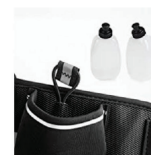
2 Bottles with Large Capacity

----- SKU: EVHY3W103 COLOR: Black / Neon Yellow