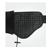
Gel-based Interior Lining