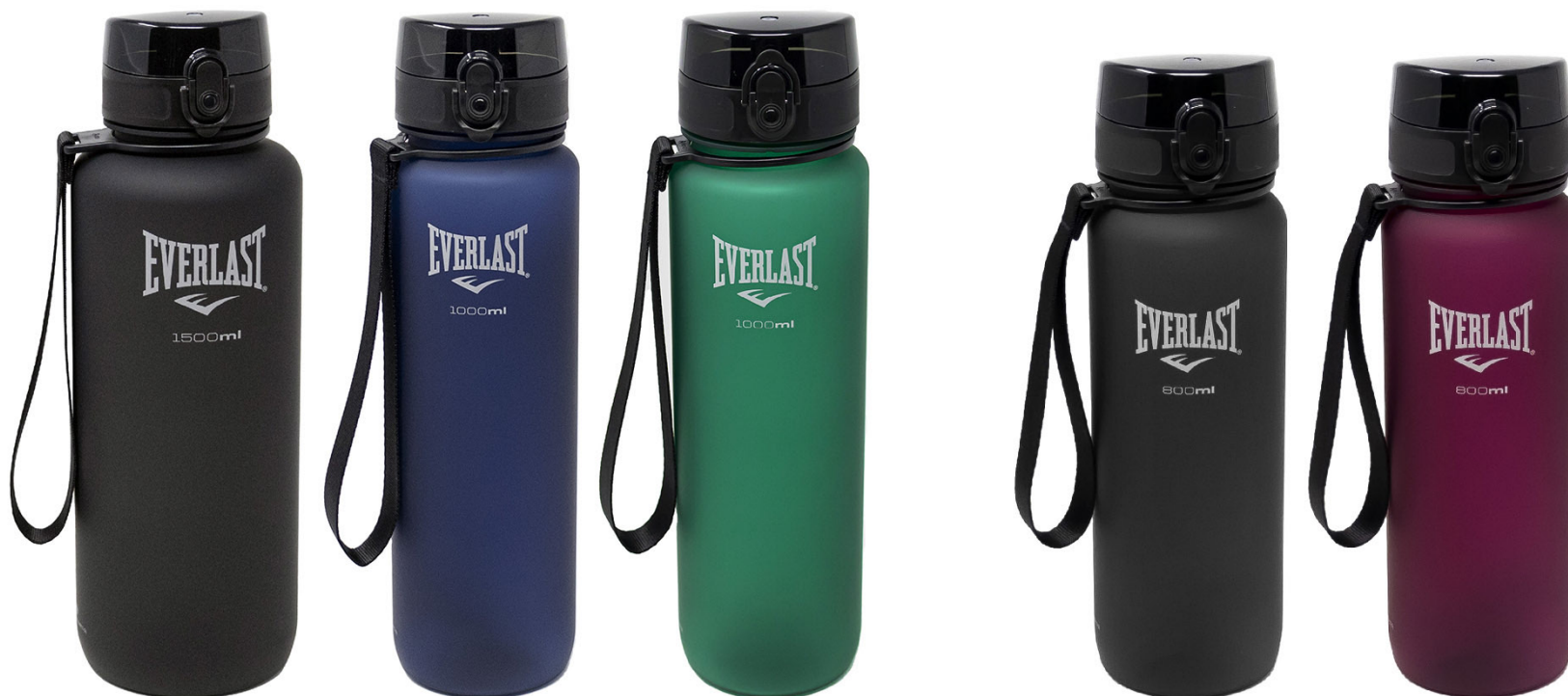
1500ml 100% BPA-FREE