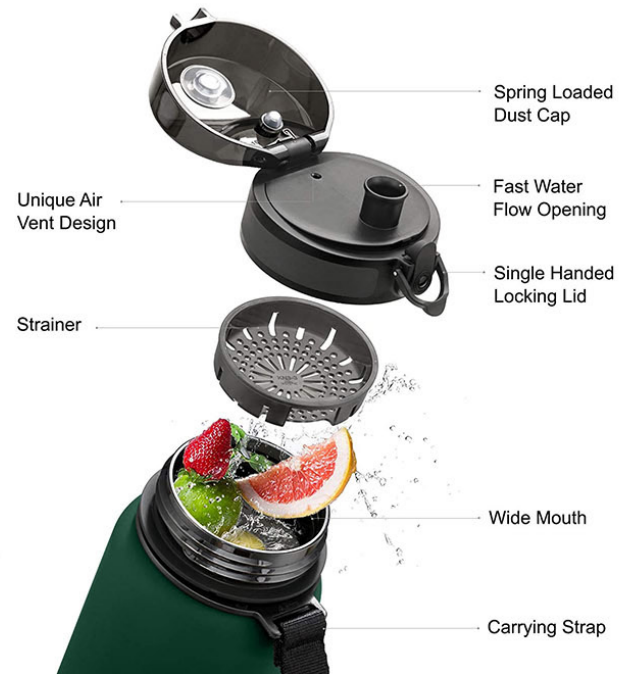
Spring Loaded Dust Cap