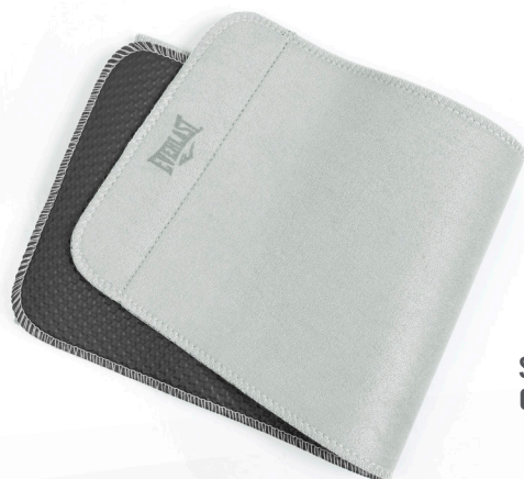
SKU: EVFA1S48-GY COLOR: Grey