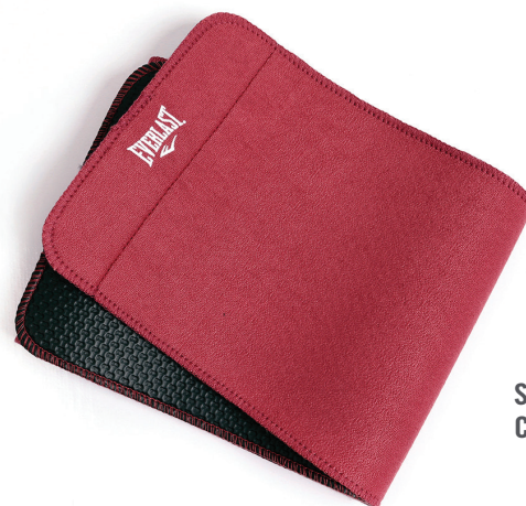
SKU: EVFA1S48-BU COLOR: Burgundy