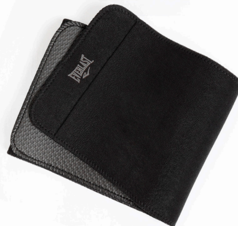
SKU: EVFA1S48-BK COLOR: Black