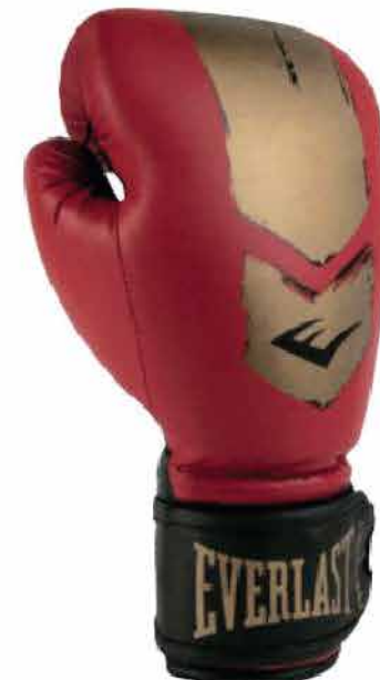
RED / GOLD