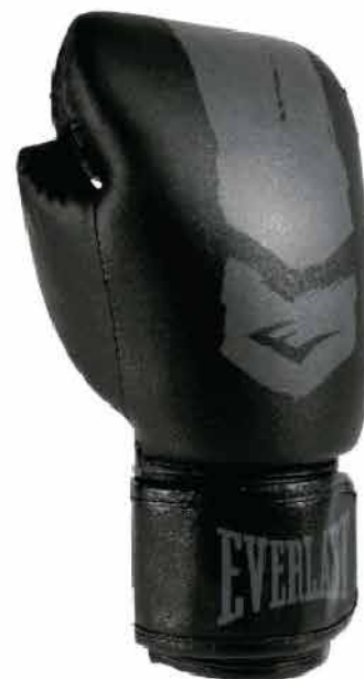
BLACK / GREY