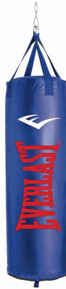
SKU: P00001258-BL 100LB