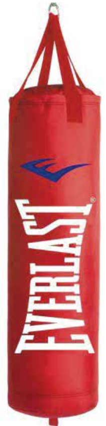
SKU: P00001258-RD 100LB SKU: P00001260-RD 70/80LB SKU: P00001264-RD 40LB