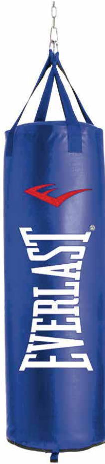
SKU: P00001260-BL 70/80LB